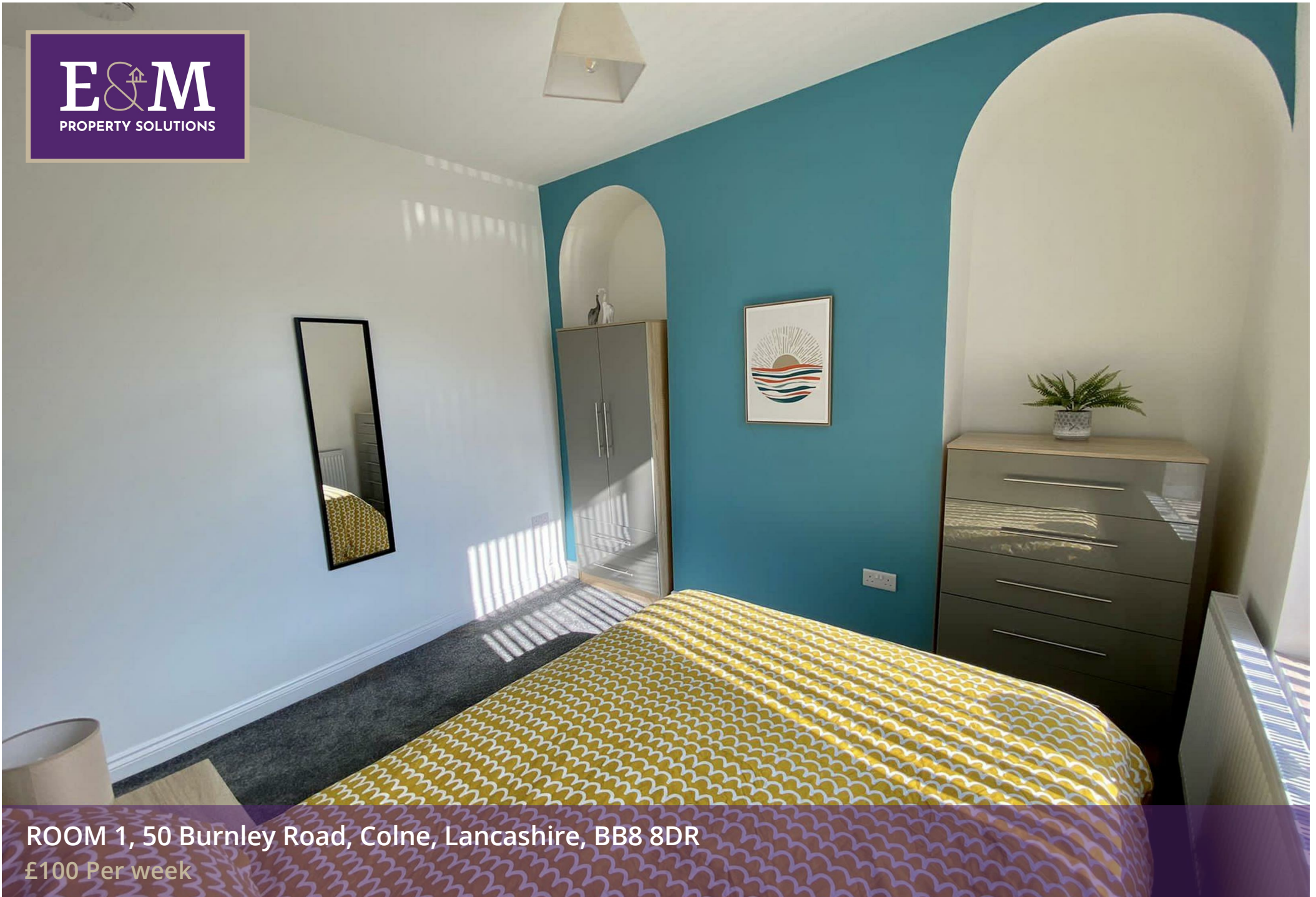
ROOM 1, 50 Burnley Road, Colne, Lancashire, BB8 8DR £100 Per week